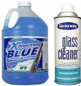
31917 Camco 0 Degree Windshield Wash Fluid 1 gallon 050 Sprayway Glass Cleaner 19 oz aerosol