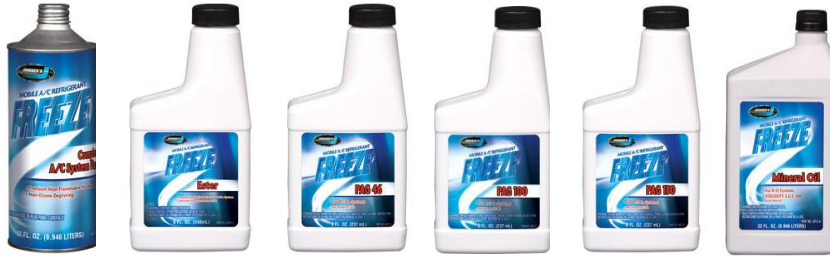
6545-6 Johnsons Air Conditioning Flush 32 oz bottle 6808-6 Johnsons Ester Oil 8 oz bottle 6812-6 Johnsons PAG 46 Oil 8 oz bottle 6816-6 Johnsons PAG 100 Oil 8 oz bottle 6822-6 Johnsons PAG 150 Oil 8 oz bottle 6912-6 Johnsons Mineral Oil 8 oz bottle