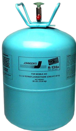
6330 R-134a Refrigerant 30lb Cylinder* *Brand subject to change