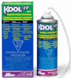
96030 LubeGard Kool It Evaporator & Heater Foam Cleaner 6 oz aerosol