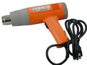
4222F Heat Shrink Heat Gun